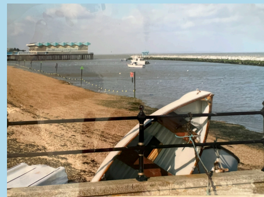
The Sports Hall Circa 1990