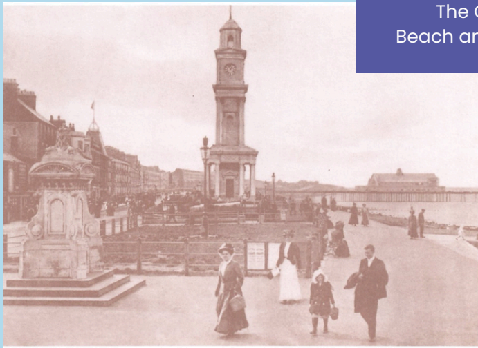
The Clock Tower Beach and Reculver c1910

The mural is currently missing... The wall it was on is covered by scaffolding and the mural has been removed. I do hope it is being restored and will be put back. Something to keep an eye on!